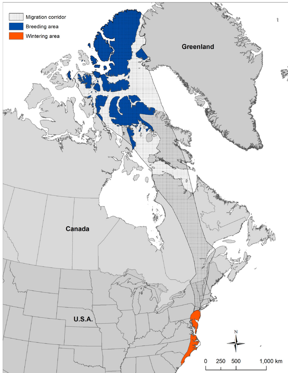
Fig. 1 Range map of greater snow geese in North America

major challenges encountered and lessons learned throughout the entire process.